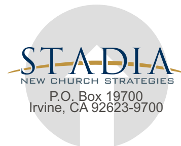
Visioneering Studios, a member of the Provision Ministry Group, provided the interior design for Provision's new home office where all gifts to Stadia are received and processed.

Last year we formed a new parent company, Provision Ministry Group, in partnership with our sister ministries Church Development Fund (CDF) and Visioneering Studios. Those sister ministries are headquartered in Southern California, where our donations are received and processed. The Southern California office recently relocated from Anaheim to the city of Irvine, and as a result all gifts to Stadia should now be sent to this new address (above).